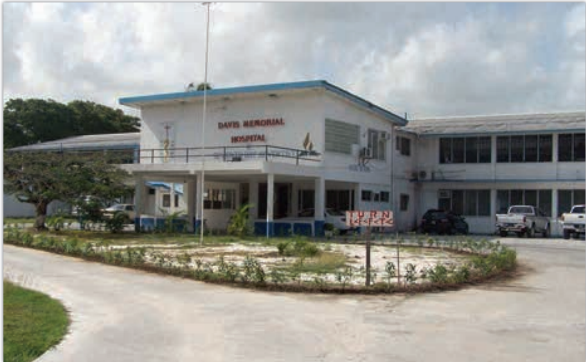
Davis Memorial Hospital, Guyana ▲