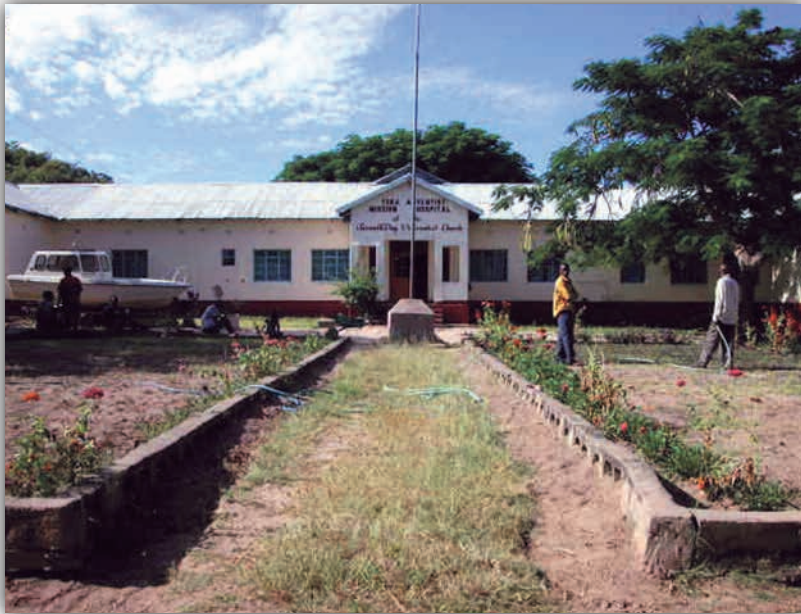
Entrance to Yuka Hospital in Western Zambia

After considerable negotiation, it was decided to purchase a five-acre parcel of land, with a large house on the property, adjacent to the Lusaka Eye Hospital. This will concentrate Adventist services in one area and provide considerable economies of scale for management purposes. Plans call for remodeling the house into a dental and medical clinic, with common reception and support areas. As the practice grows during the next several years, plans will be laid for building a completely new facility on this property that can enable AHI-Zambia to realize its dreams of creating a new model of health care in the country. AHI is particularly indebted to the National Association of Seventh-day Adventist Dentists (NASDAD) and Hope for Humanity for the funds to obtain this property and establish the new clinic.