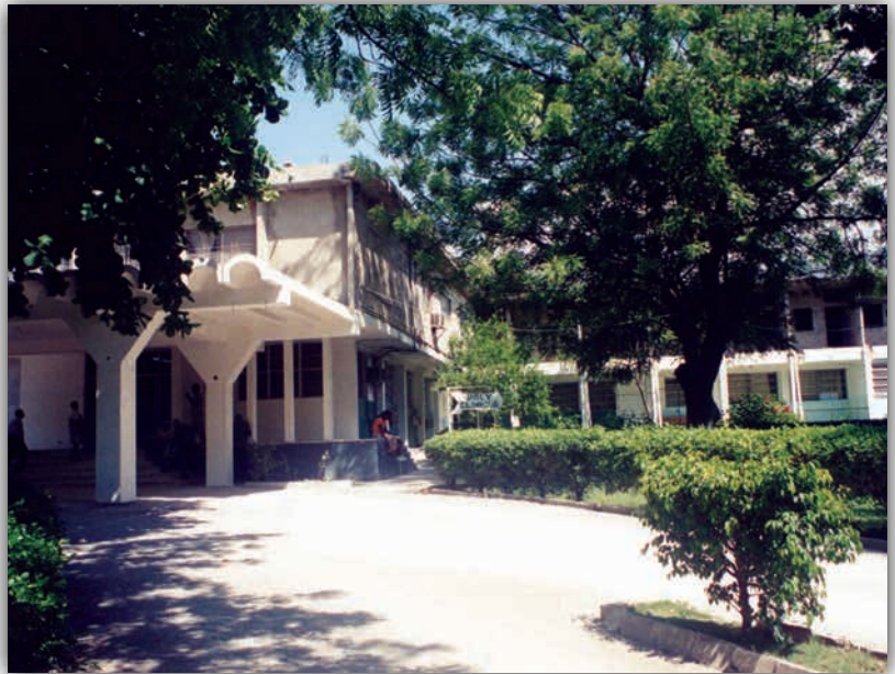
The entrance of Hopital Adventiste d'Haiti