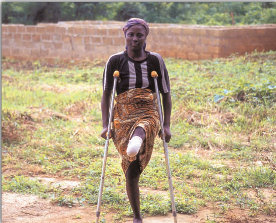
A patient at Ile-Ife Hospital

Finally, two years ago, just as Nigeria was joining AHI, the decision was made to finally start the residency program. Encouragement was given when some of the government teaching hospitals also asked to rotate residents at Ife, recognizing the quality of specialists that were there. The first resident dropped out after