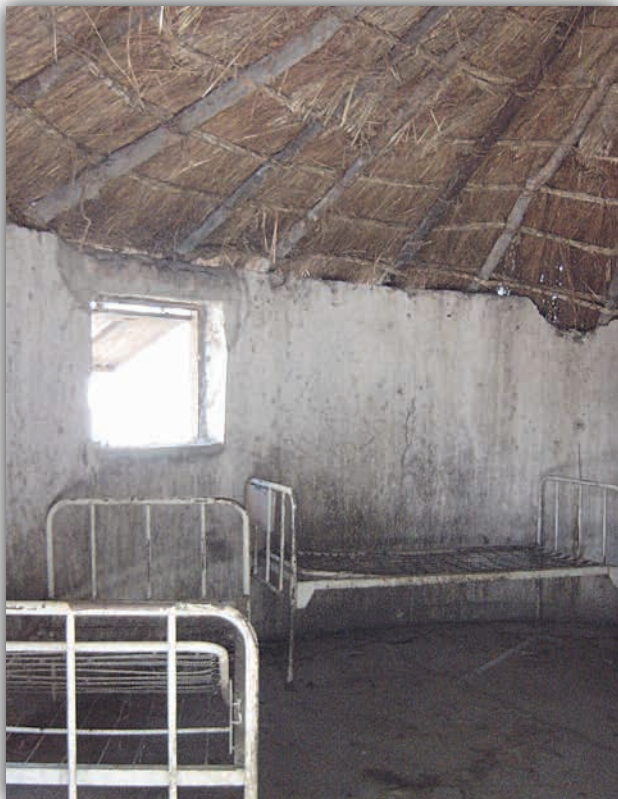
Hospital room in Bere, Chad

his family in Yaounde to begin this project. Plans are now underway to have his two oldest children go to boarding academy and his wife and youngest will join him at Bere. He has already gained the confidence of the World Bank consultants and the Ministry of Health officials and is ready to move forward.