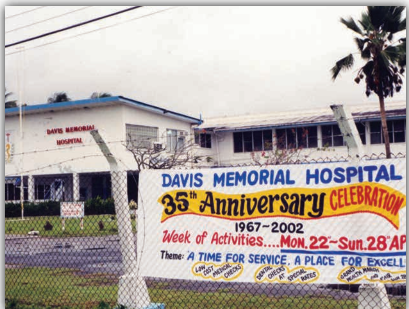
Davis Memorial Hospital celebrates 35 years