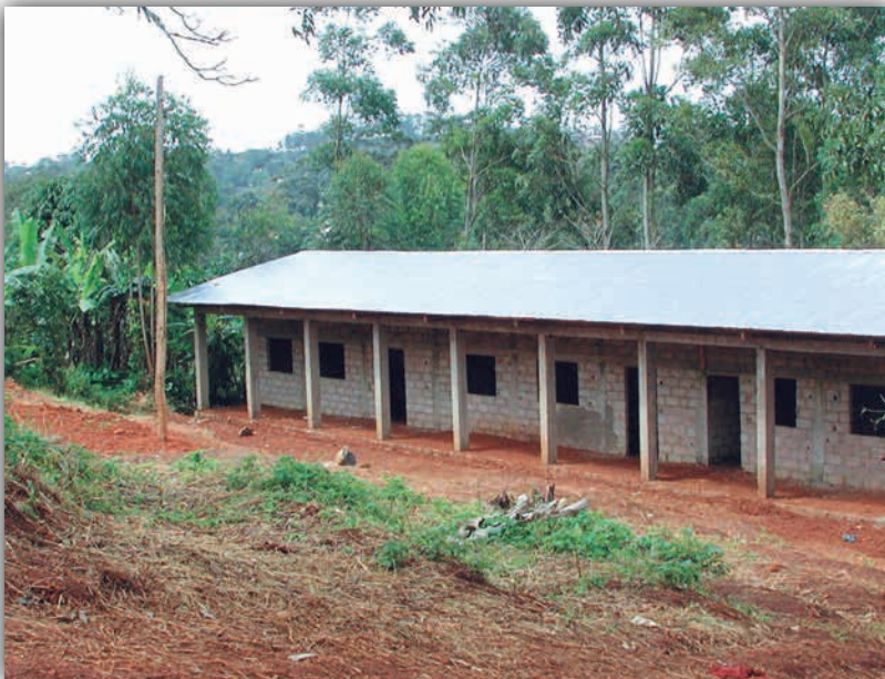
Developing a mother and child center in Cameroon

The final goal in the country is to offer health science training programs at the new university. The government has approved this plan in general and specific plans to start with a nursing school are being considered. This will require additional buildings and faculty. Koza, Batouri, and Buea can all be included in these rotations with careful planning of the curriculum and scheduling.