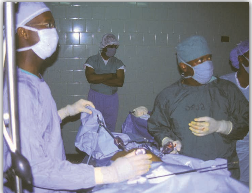
Laparoscopic surgery in Guyana after electrical systems are repaired

Almost $500,000 has been received from Hope for Humanity in the past two years for AHI projects. This has been absolutely crucial for the wide variety of projects that AHI has undertaken in its member institutions. The next time you hear about Ingathering: Hope For Humanity, remember all that it accomplishes and look for ways to participate in its important ministry.