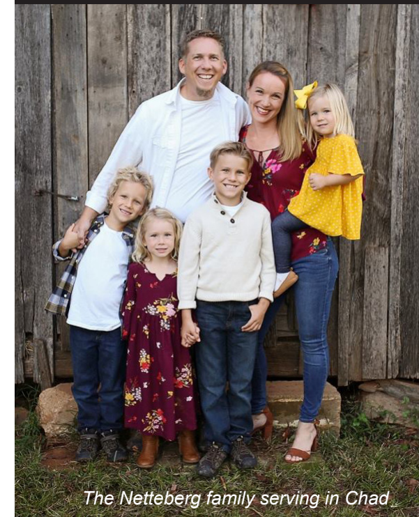
The Netteberg family serving in Chad

according to the world health organization